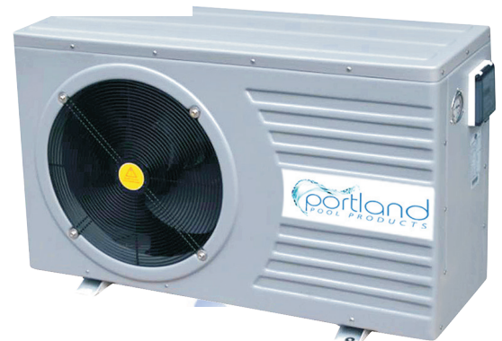
PORTLAND HEAT PUMP Heating & cooling with reversible defrosting